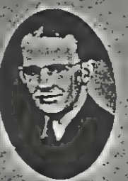
Wm. J. Cunningham Real Estate